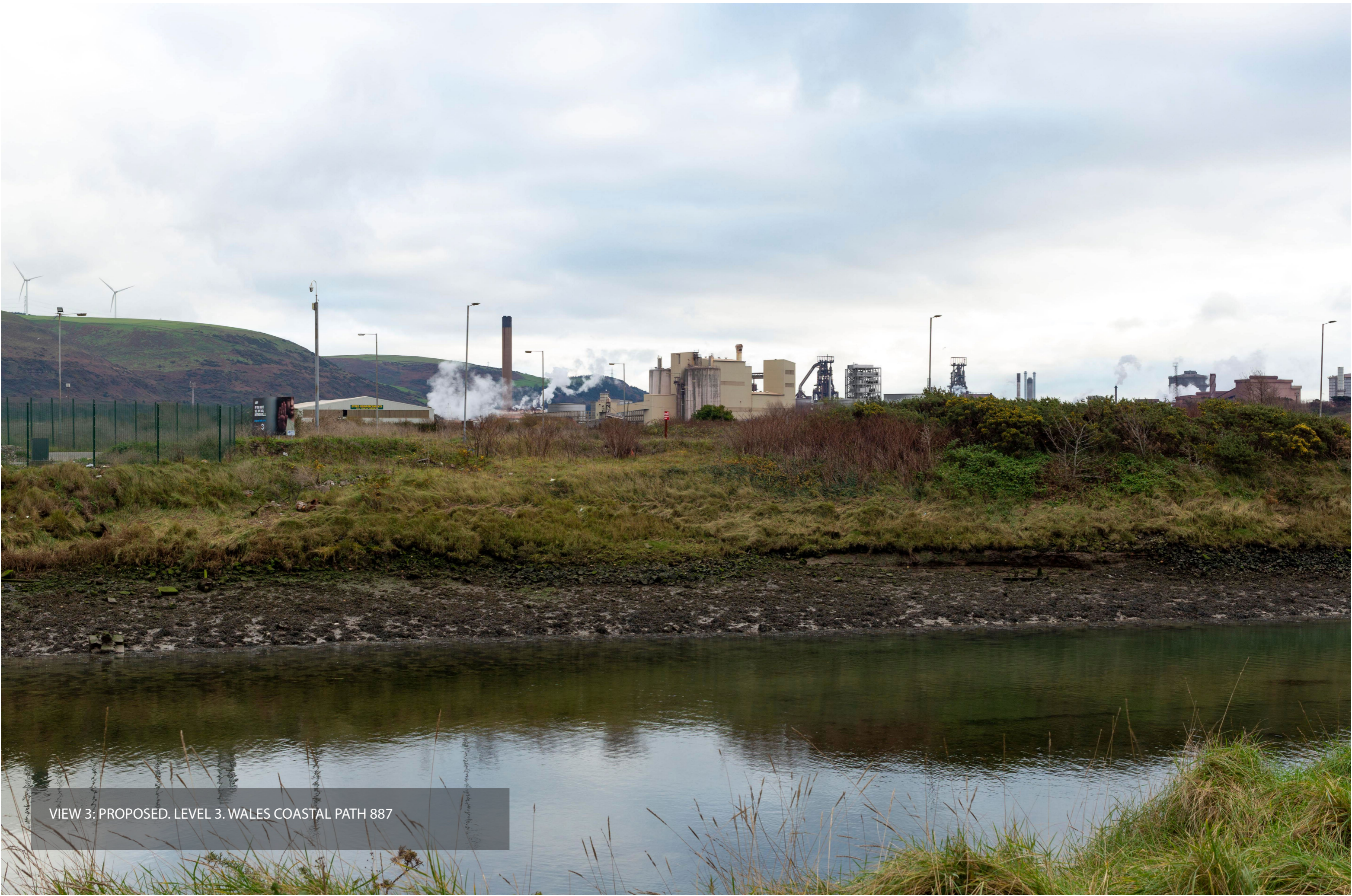
VIEW 3: PROPOSED. LEVEL 3. WALES COASTAL PATH 887