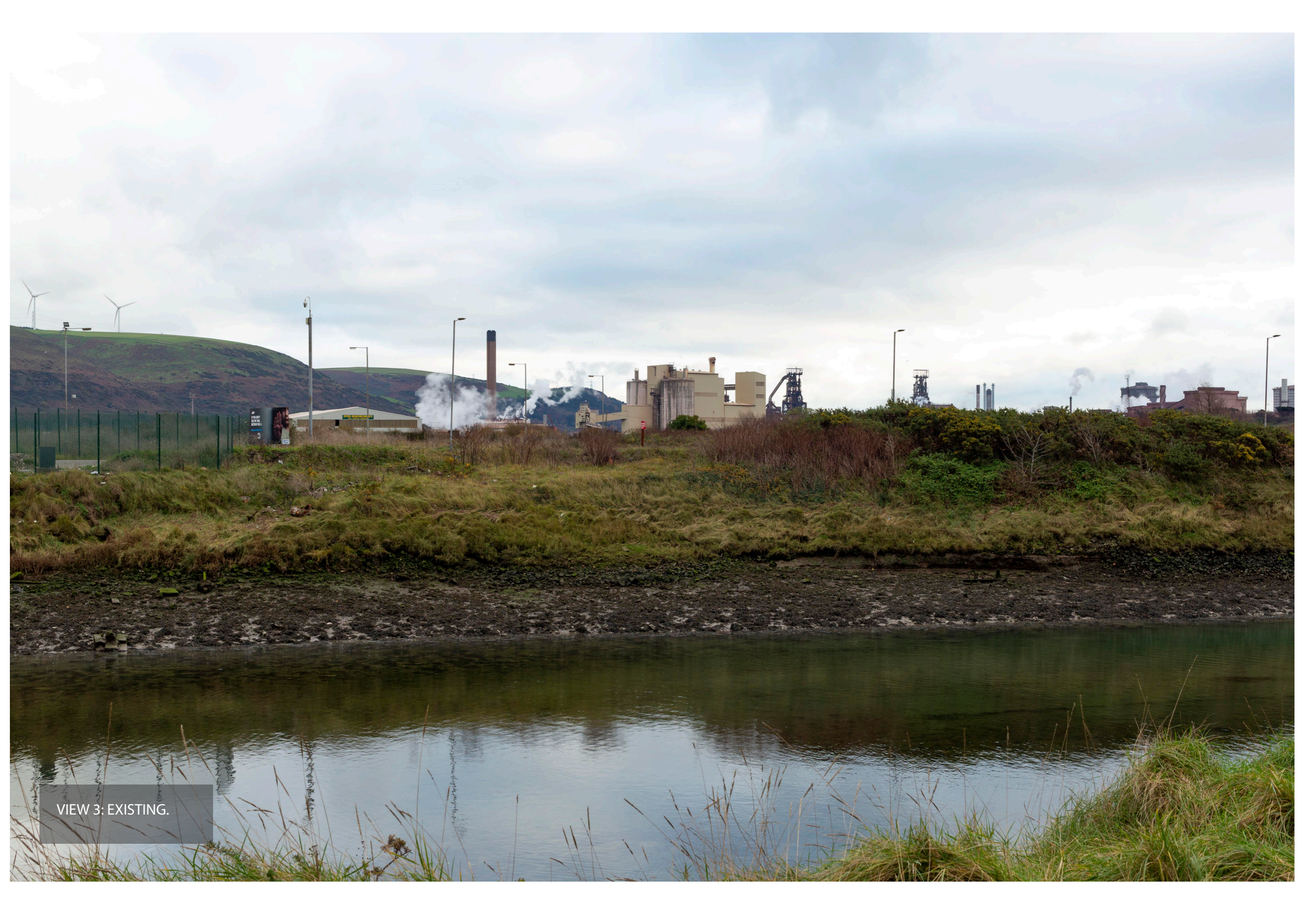
VIEW 3: EXISTING.