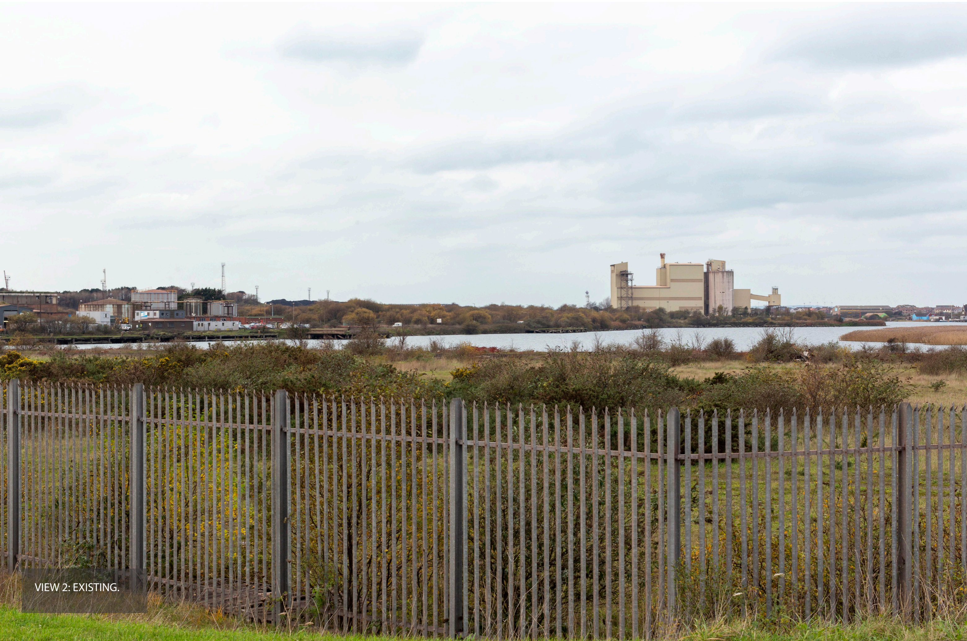
VIEW 2: EXISTING.