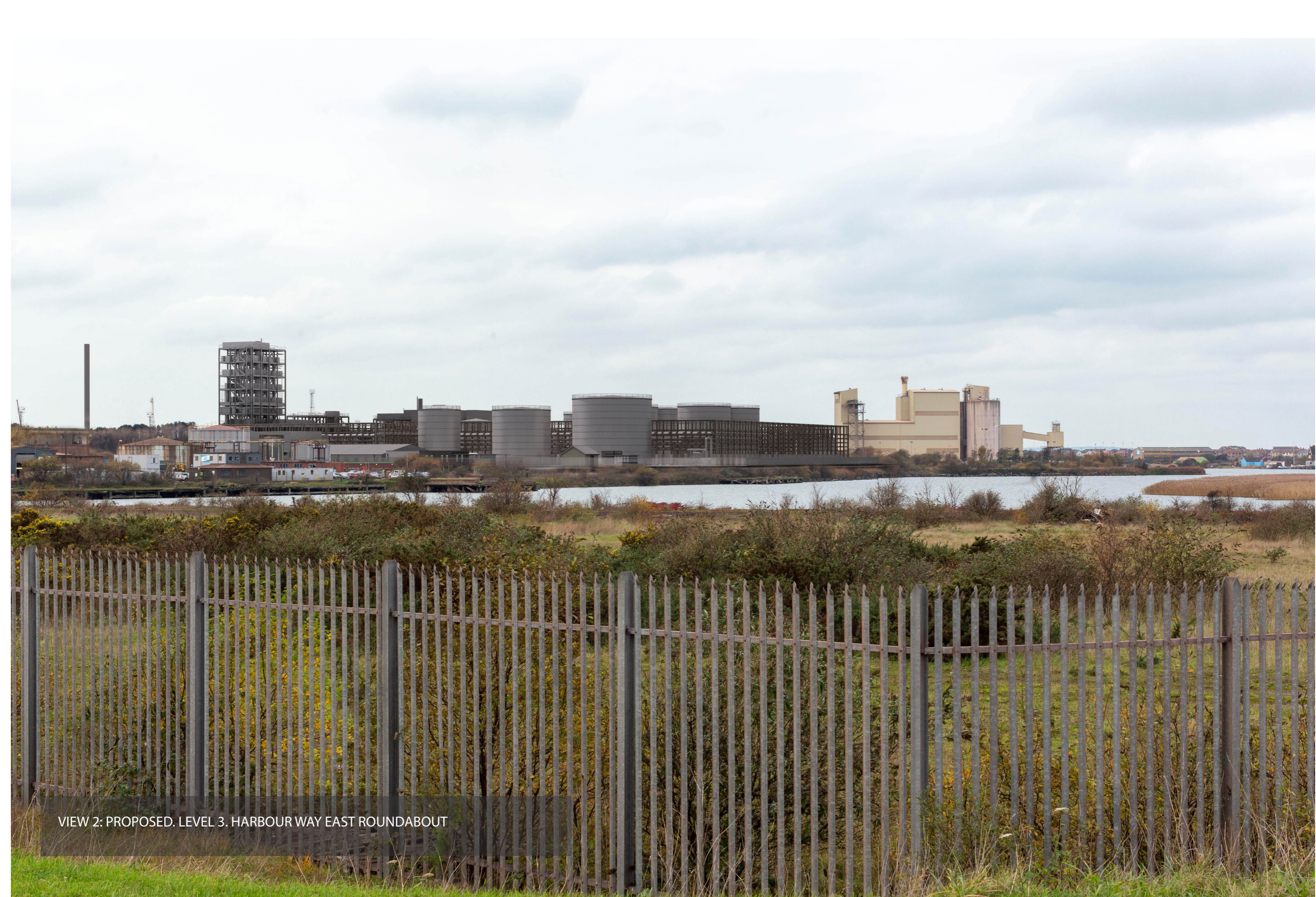
VIEW 2: PROPOSED. LEVEL 3. HARBOUR WAY EAST ROUNDABOUT