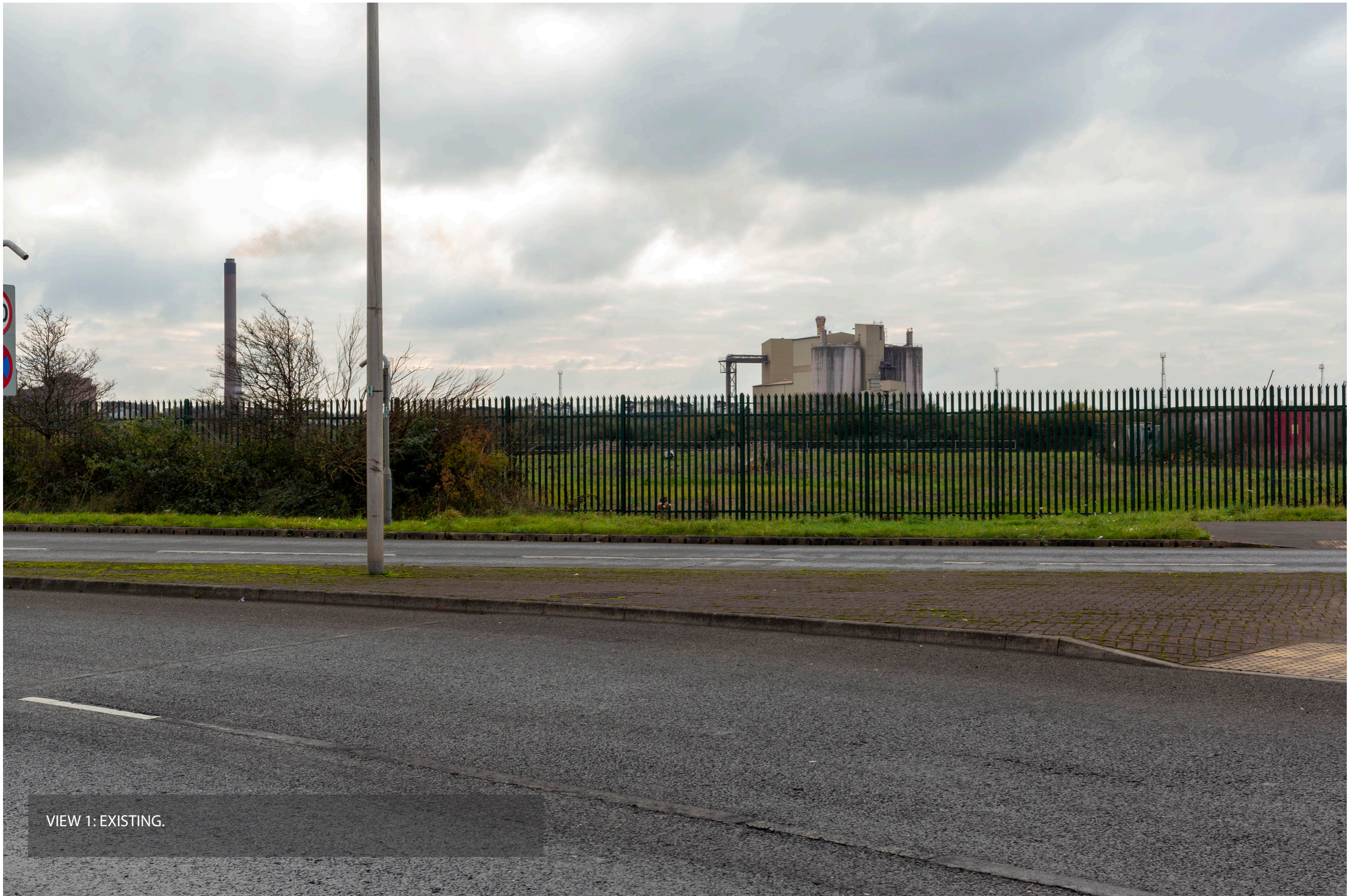
VIEW 1: EXISTING.